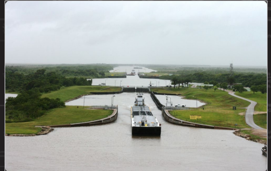
Colorado River Crossing