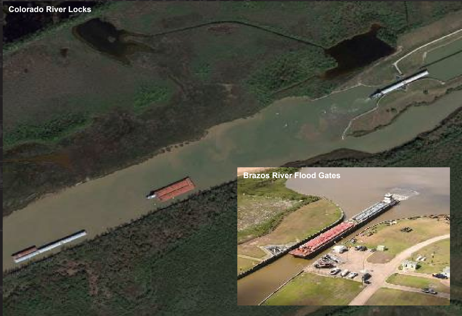
Brazos River Flood Gates