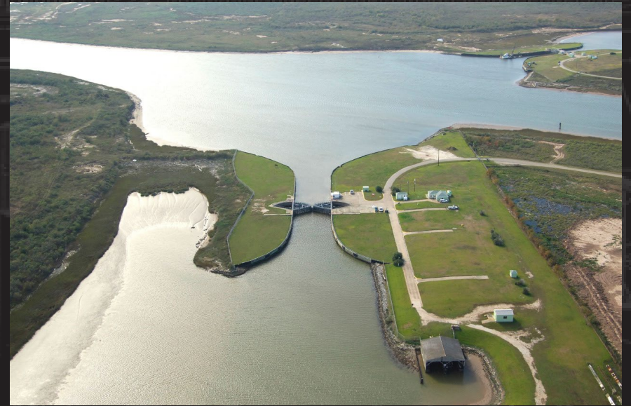
Brazos River Crossing